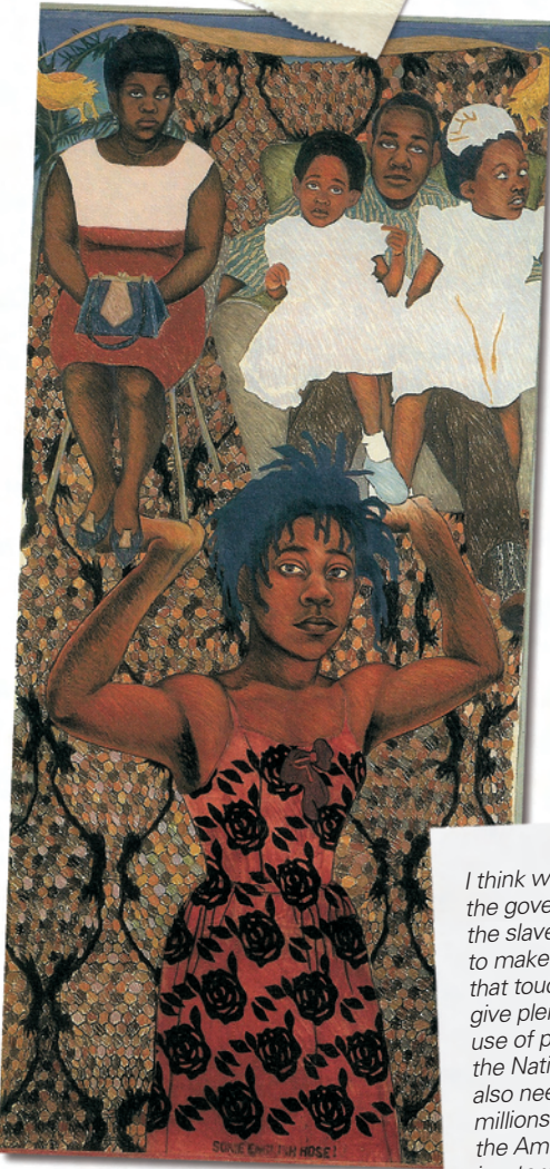
SHE AIN'T HOLDING THEM UP, SHE'S HOLDING ON (SOME ENGLISH ROSE) 1986